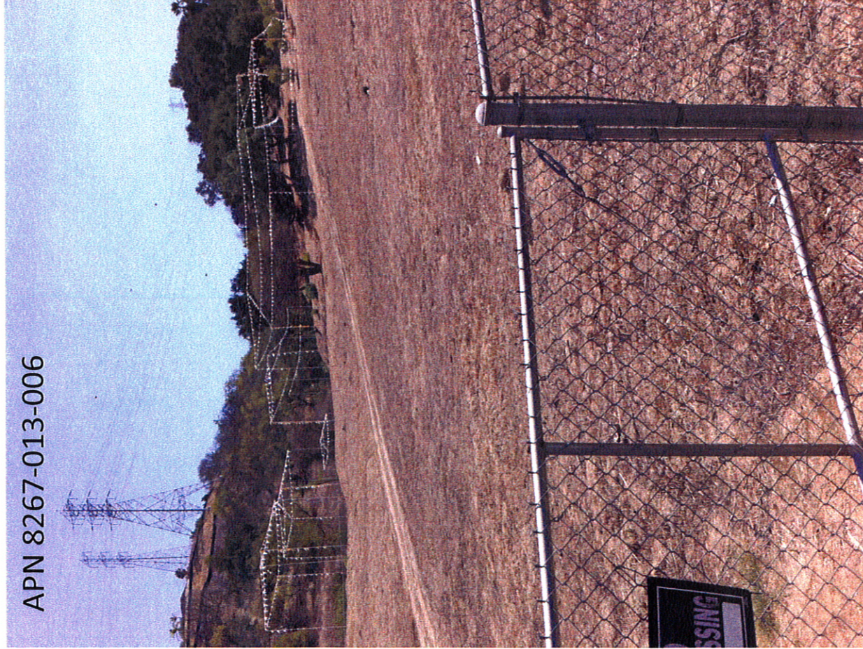
View from Fullerton Road looking southeast.