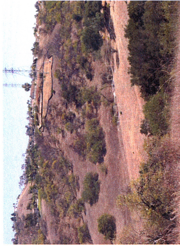
Views from Habitat Authority's Black Walnut Trail looking southeast.